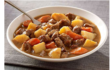
Beef Stew Meat and California Veggies for Irish Stew