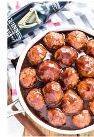
See the March Newsletter for Guinness Glazed Meatballs