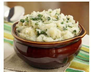
Use Garlic Mashed Potatoes and Shredded Cabbage for Irish Colcannon