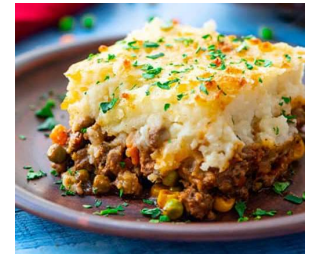
Use Garlic Mashed Potatoes and 5-way Veggies for Shepherd's Pie